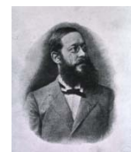
Josep von Mering

In 1893 Édouard Laguesse proposed that diabetes was caused by the absence of the substance produced by the islets of pancreas.