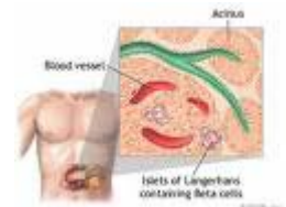
Islets of Langerhans

The next step in the invention of insulin took place 20 years later. In 1889 the German scientists Oskar Minkowski and Joseph von Mering were making experiments on dogs during their studies on the role of the pancreas in the metabolism of fat. A few days later when the pancreas had been removed from the dog, the dog-keeper noticed that hordes of flies gather around the urine of that dog. When the researchers studied the urine it was rich in sugar. Then they re-transplanted pancreatic tissue under the dogs' skin and the disease disappeared. Because of the decay of the exocrine pancreas due to the absence of a duct after such a procedure, they proposed that diabetes was caused by internal deficiency of a substance excreted by pancreas into blood.